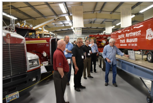
Great Connections (Spring 2016)