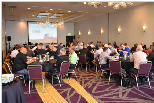
Great Information (Spring 2016)

DRESS: ITPA fall events are business casual. Dinners are dressy.