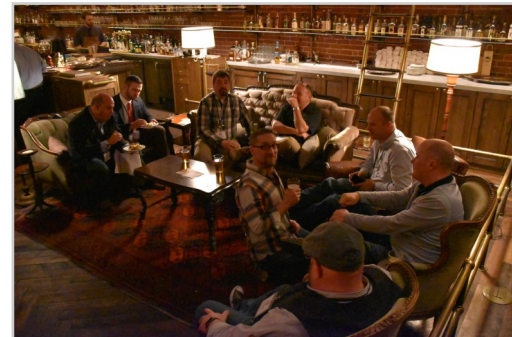
Great Networking (Spring 2016)

2016 Fall Meeting, Lodge and Club, Ponte Vedra, FL, October 20-22, 2016